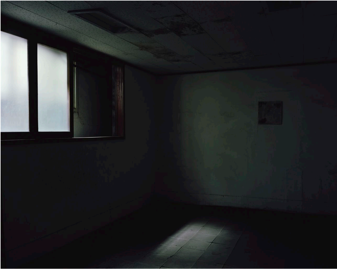
TORTURE AND INTERROGATION ROOM, 505 BLDG.